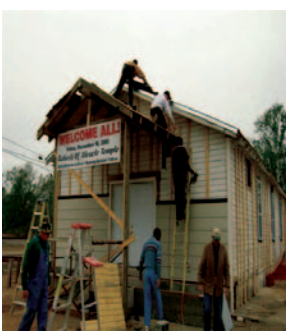
Miracle Temple Holiness church and our crew

ing, which also received a complete interior and