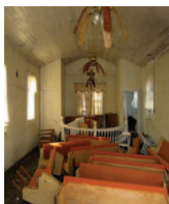
The storm surge pushed water almost to the ceiling of St. Marks in Waveland MS.

You can read more about our Katrina relief program, called “Adopt-a-Church” on the website at www.adoptachurch.com