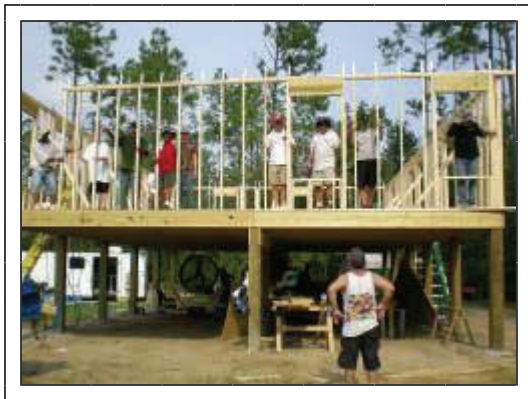
Are you sure the window goes here?