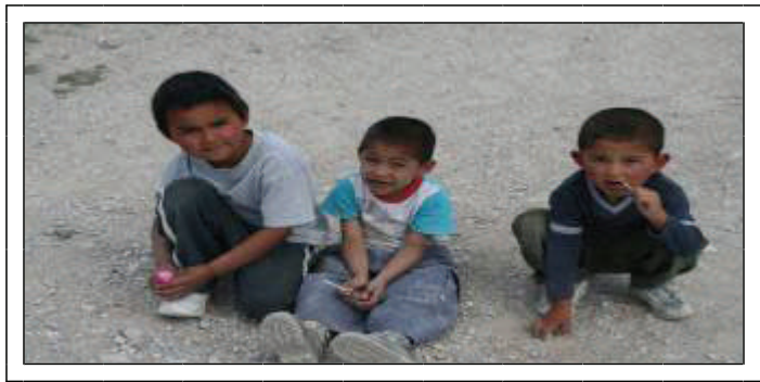
Children in Galeana, MX