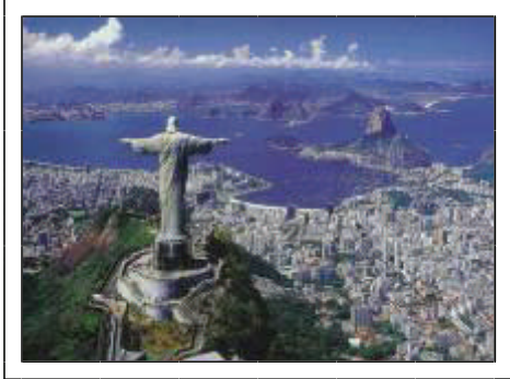
Who we work for