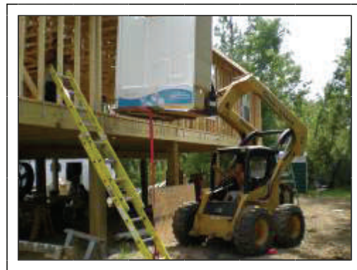
Good job CJ—just don't drop it!