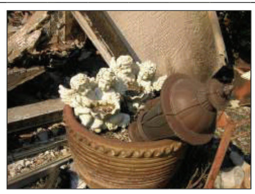
Amazing what survives the fires