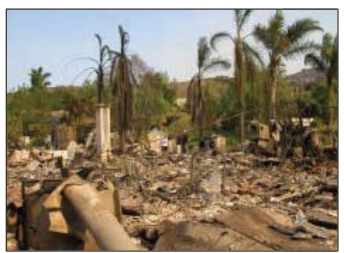
Devastation in San Diego