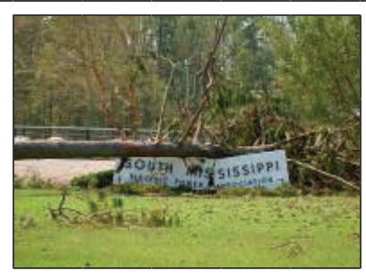
The power of nature